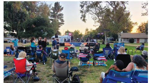
Early arrival of audience and repeated viewing your company brand before showtime