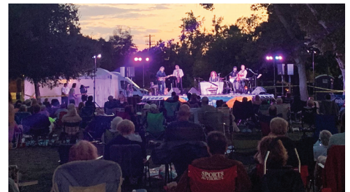
NoHo Summer Nights always draw in the community!