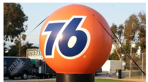
Creative branding opportunities available— make a BIG impression!