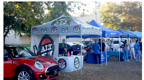
Ample exhibition space for vendors and sponsors adjacent to the crowd