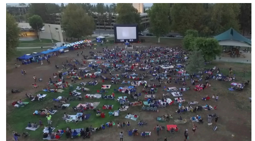
Early arrival of audience and repeated viewing your company brand before showtime