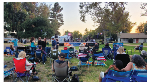
Early arrival of audience and repeated viewing your company brand before showtime